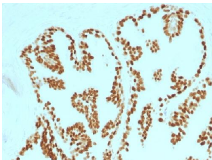
Formalin-fixed, paraffin-embedded human Prostate Carcinoma stained with FOXA1 Monoclonal Antibody (FOXA1/1515).