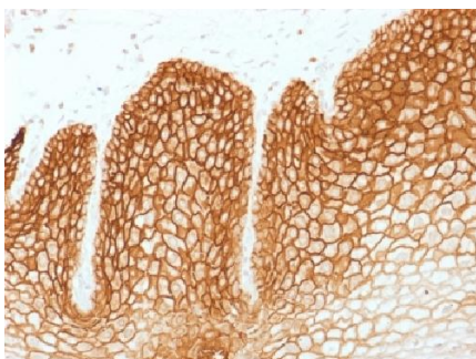
Formalin-paraffin human Cervical Carcinoma stained with CD44v6 Monoclonal Antibody (CD44v6/1246)