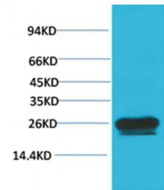
Western blot analysis of Hela with HSP27 Mouse mAb diluted at 1:2,000