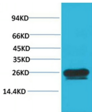
Western blot analysis of Hela with HSP27 Mouse mAb diluted at 1:2,000