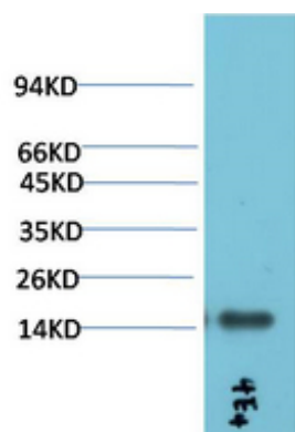
Western blot analysis of Human Serum using TTR Mouse mAb diluted at 1:2000

Please note: All products are 'FOR RESEARCH USE ONLY. NOT FOR USE IN DIAGNOSTIC OR THERAPEUTIC PROCEDURES'.