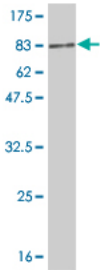
Antibody Reactive Against Recombinant Protein.Western Blot detection against Immunogen (81.73 KDa) .